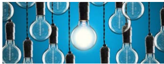
Demonstrate Sector Leadership