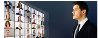
Contribute to and help Shape the Dialog

The AEE Canada East is offering a selection of feature sponsor opportunities. Each sponsor level features a variety of benefits intended to provide Brand Value and Conference Profile. Select the package that best fits your needs and join us today.